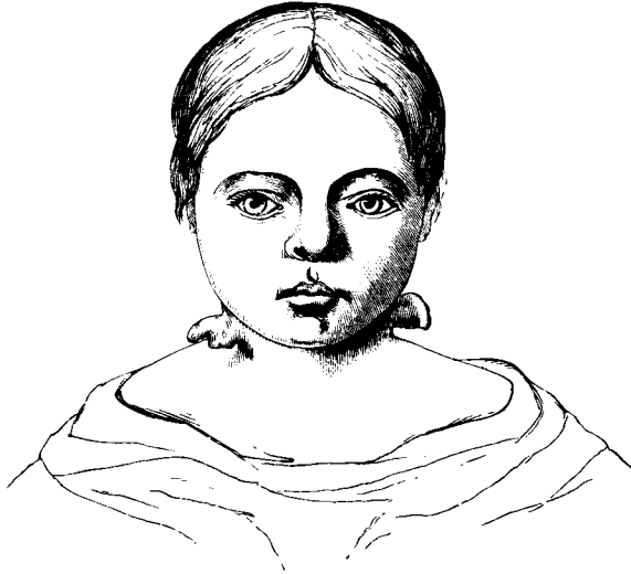
FIG. 28. Child having a well-developed supernumerary auricle on each side of the neck (from BIRKETT).

A vertical section was made in the long axis of each growth; and the tissues of the lobe and of the fibro-cartilage of the auricle were clearly distinguished. The shape of the fibro-cartilage resembled more or less closely in parts, the outline of the proper auricle, and its tissues were the same. BIRKETT, J., Trans. Path. Soc. Lond. , ix., 1858, p. 448, fig. 1 .