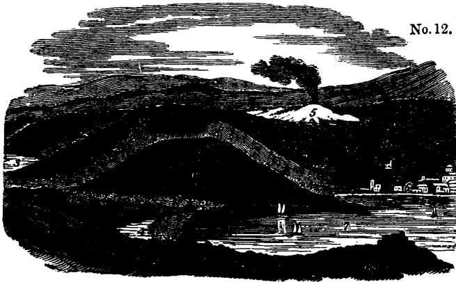
The Phlegræan Fields.

matter consisted of pumiceous scoriæ and masses of trachyte, many of them schistose, and resembling clinkstone. The Monte Nuovo is declared, by the best authorities, to stand partly on the site of the Lucrine lake (fig. 4, No. 12*), which